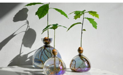
Avocado Vase & Acorn Vase - ILEX STUDIO