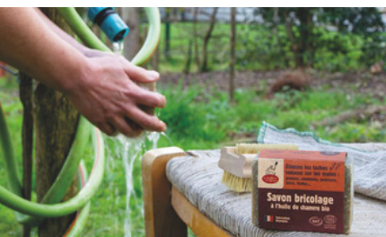
Organic Hemp Oil DIY Soap - ECODIS