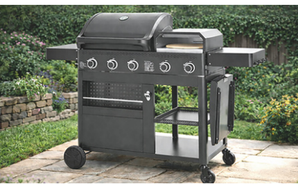
3-in-1 Gas Barbecue - FLAMY - COOK IN GARDEN

It is worth noting that several product innovations stood out among them, notably those focused on outdoor wellbeing and on solutions designed to make maintenance easier. In summer, the terrace emerges as the garden's central living space . Its layout increasingly relies on privacy screens to create seclusion, planters and pots to introduce greenery, more compact and multifunctional outdoor kitchen solutions , and barbecues designed for smaller spaces, extending through to pool-related equipment and accessories.