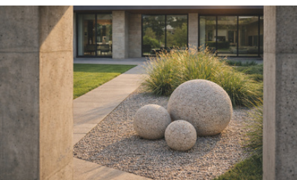
Art Déco - GRANULATI ZANDOBBIO