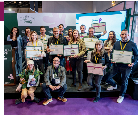
Winners of the 2026–2027 Garden Collections Awards