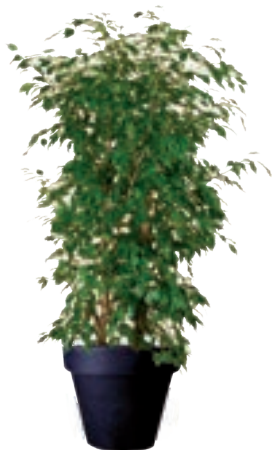
Ref. 113.160 - Ficus ht 1,80/2m Ref. 134.359 - Vas three black