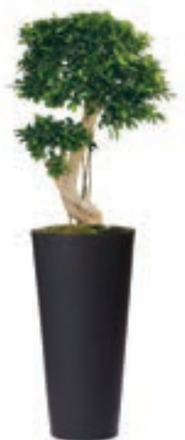
Ref. 113.410 A - Bonsai ficus nitida in black Partner pot total ht 1,20 / 1,50 m

Our floral selection or composition is beyond the capability or creativity of our master gardeners. We guarantee to find the right arrangements for you.