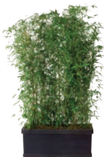
Ref. 142.960 - Black rectangular pot 100 x 32 cm Bamboo hedge ht 2 / 2,50 m