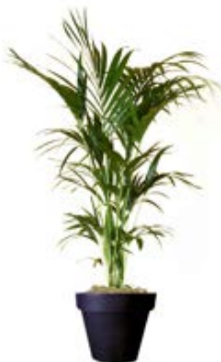
Ref. 113.200 - Kentia ht 1,80/2m Ref. 134.359 - Vas three black