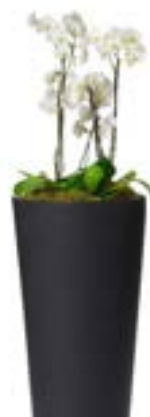
Ref. 113.410 C - Orchids in bac black Partner total ht 1 / 1,10 m