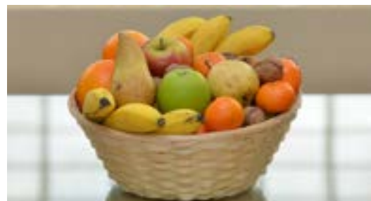
Ref. Pofruit 05K