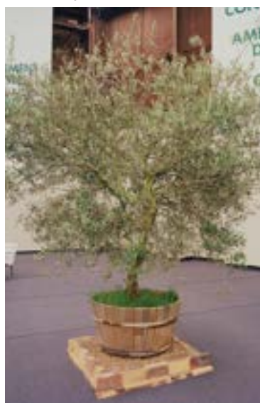
Ref. 122.160 - Olive tree Ø 1,50m ht 2,50/3m