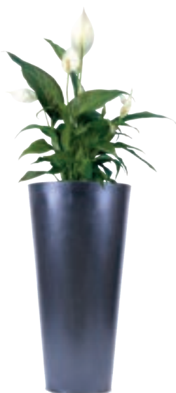
Ref. 113.300A - Spatiphyllum sensation in black Partner pot ht 1,80 / 2 m