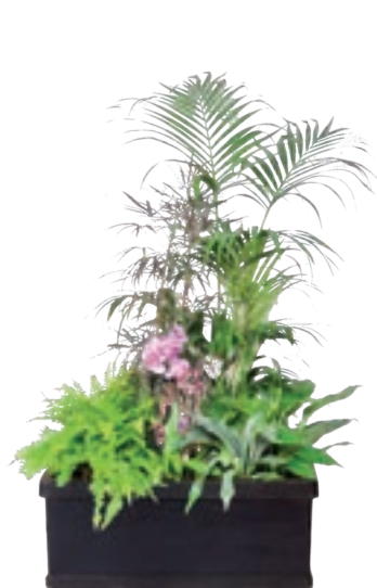
Ref. 143.200 - Black rectangular pot 100 x 32 cm Plants composition