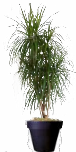
Ref. 113.130 - Dracaena fragrans ht 1,80/2m Ref. 134.359 - Vas three black