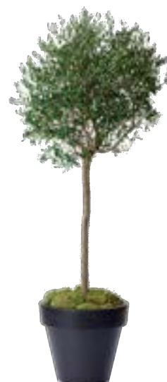
Ref. 112.020 - Olivier Ref. 134.359 - Black vas three