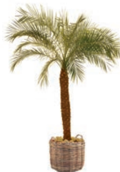
Ref. 113.230 - Phoenix roebelinii ht 1,80 / 2,10 m Ref. 136.300 - Basketwork