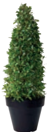
Ref. 112.135 - Bay tree conical ht 1,50m Ø40/50cm Ref. 134.359 - Vas three black

At Gally, we pride ourselves with the reputation of our presentations of both popular and exotic plant selections, presented in standard or tailor-made containers and designed to suit all tastes and decors. The objective is never to clash with or change the existing environment. Our specialists seek to create floral displays that blend with, and enhance, the beauty of the existing colour schemes and atmosphere.