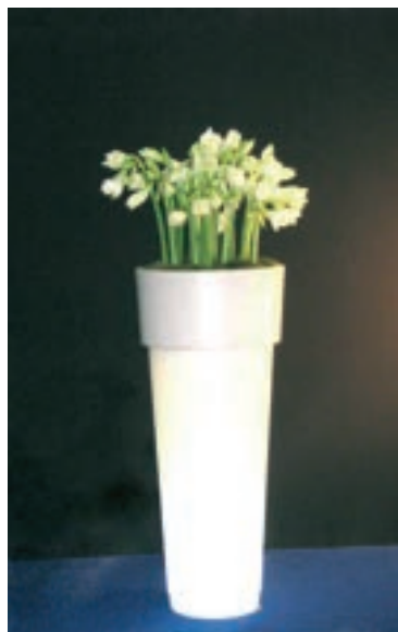
Ref. 134.320 A - Bac Marcantonio light Ø 50 cm ht 1,20 m with white amaryllis

The Gally Design Centre is staffed by knowledgeable and innovative experts who are ready to respond to every customer request. Whether a standard selection or a bespoke solution, our master gardeners guarantee an unsurpassed level of professional advice, project execution and customer satisfaction.