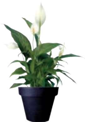
Ref. 113.310 - Spatiphyllum Sensation ht 1,20/1,50m Ref. 134.359 - Vas three black