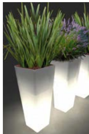
Ref. 134.327 A - PVC Kubis ASQ light 46 x 46 cm ht 1,10 m with Phormiums