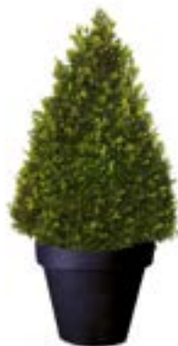
Ref. 111.140 - Box conical Ø50 cm ht 1/1,20m Ref. 134.359 - Vas three black