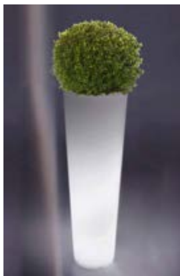
Ref. 134.326 A - PVC New Pot Maxi light Ø 44 cm ht 1,20 m with box globe Ø 45 cm