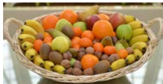
Ref. Pofruit 10K