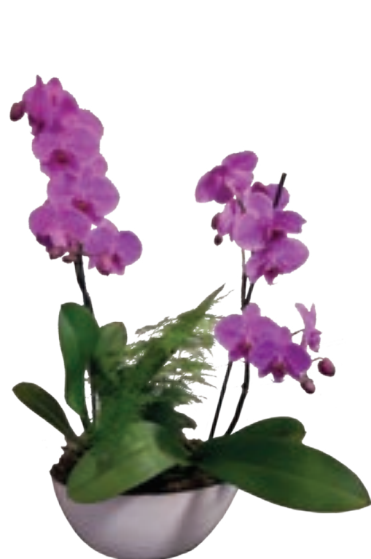
Ref. 182.200 - Bowl of flowers Ø 30 cm