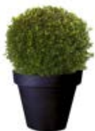
Ref. 111.125 - Box globe Ø35/40 cm ht 0,50m Ref. 134.359 - Vas three black