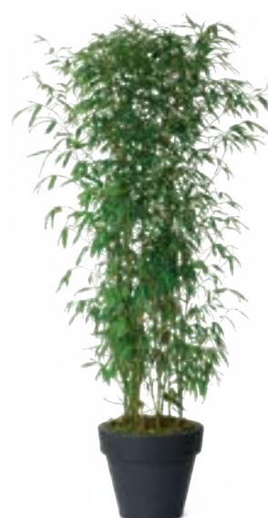
Ref. 111.110 - Bamboo ht 1,50 / 2 m Ref. 134.359 - Black vas three