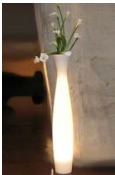
Ref. 134.259 A - Scarlett light pot Ø 28 cm ht 1,80 m with white Arums and foliage