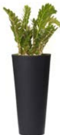
Ref. 113.410 B - Zamioculcas in black Partner pot total ht 1,30 / 1,50 m