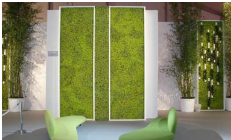
Prices on demand