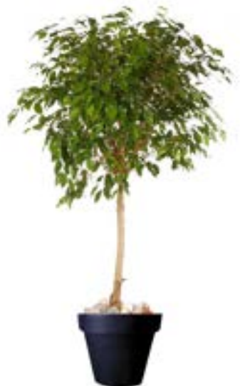
Ref. 123.220 - Ficus globe Ø1,20/1,50m ht 2,50 / 3m Ref. 134.359 - Vas three black