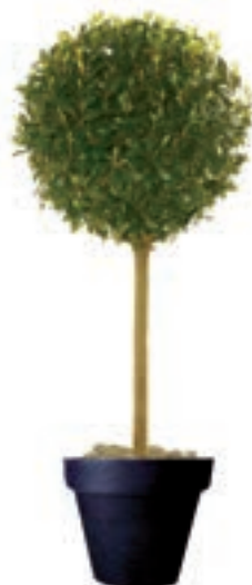
Ref. 112.160 - Bay tree globe ht 1,80m Ø60cm Ref. 134.359 - Vas three black