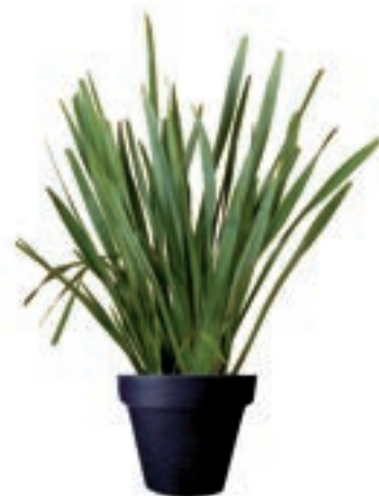
Ref. 112.300 - Phormium ht 1,20/1,50m Ref. 134.359 - Vas three black